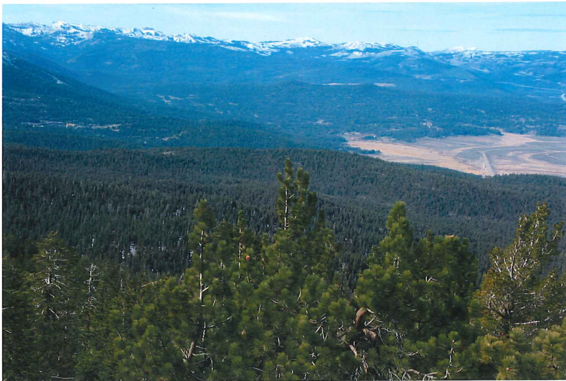
Sierra Pacific Industries Martis Valley land coveted for conservation

The preservation of the 6,376 acres also enhances public recreation opportunities in the region. There are more than 40 miles of existing trails on what is now private land. Conservation efforts ensure public access to these trails for current and future generations to enjoy.